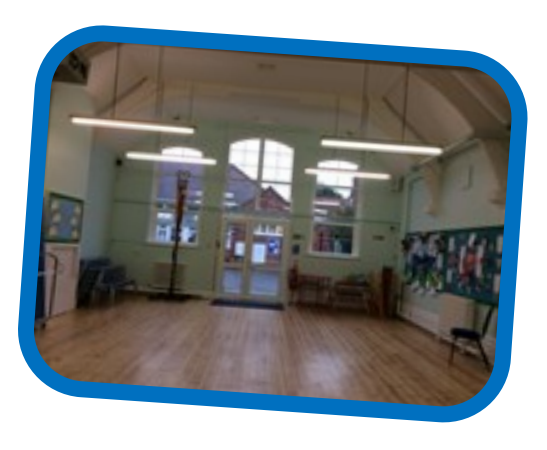
Window replacement – completed