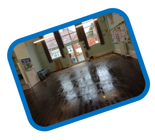
Window replacement - work in progress